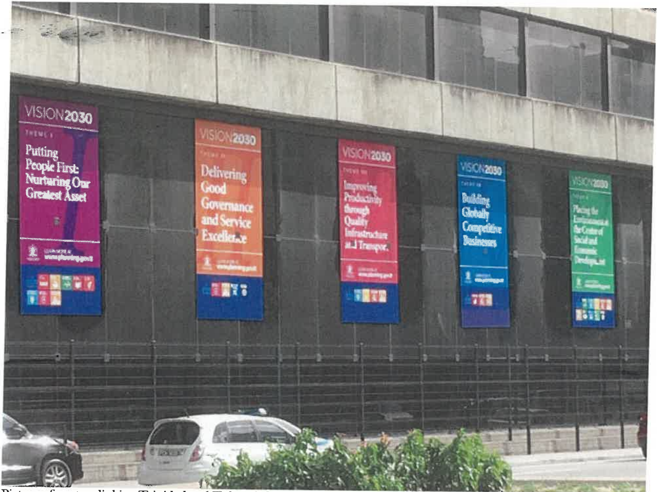
Picture of posters linking Trinidad and Tobago's National Framework, Vision 2030 and the UN Sustainable Development Goals, at the Eric Williams Financial Complex in the capital city, Port of Spain.

Office of the Prime Minister (Gender and Child Affairs) Beijing + 25 Report October 2019